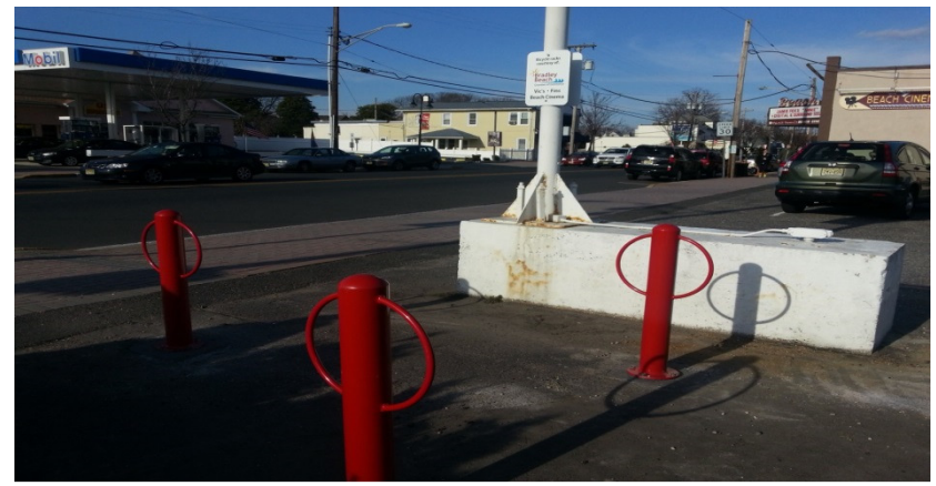
New bike racks installed in the parking lot of the Beach Cinema. ******

Tranquil Garden Tea Room's Ribbon Cutting Valentine's Day, February 14<sup>th</sup>.