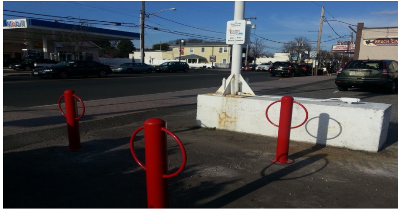
New bike racks installed in the parking lot of the Beach Cinema.